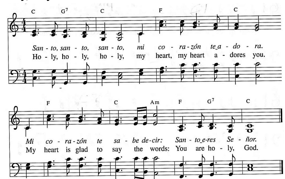
?1999 Augsburg Publishing Co. All rights reserved. Reprinted under OneLicense.net #A-712882